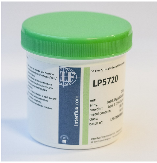
Products pictured may differ from the product delivered

The solder paste is classified as RO LO according IPC and EN standards.