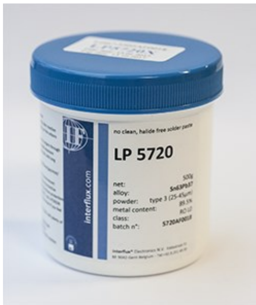
Products pictured may differ from the product delivered

The solder paste is classified as RO L0 according IPC and EN standards.