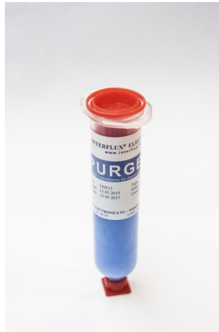
Products pictured may differ from the product delivered

The Interflux® Purgel is designed to purge, clean and condition dispensing valves, pumps and jetting systems without the inconvenience of equipment disassembly. It conditions dispensing valves, pumps and jetter parts for long storage and maintains readiness for a next operation.